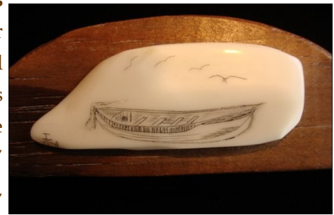
Scrimshaw Design of Whaleboat