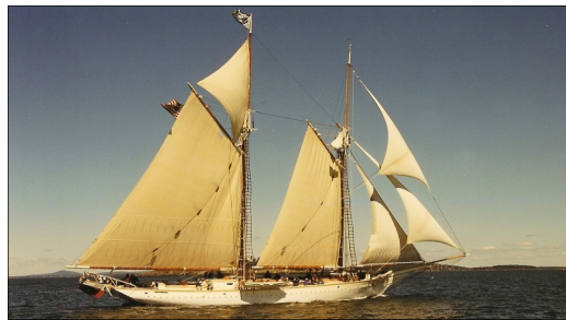
Windjammer Schooner Heritage under sail off the Coast of Maine