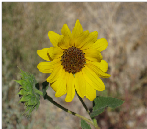
Idaho, 2010